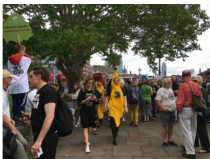
Fair Trade bananas