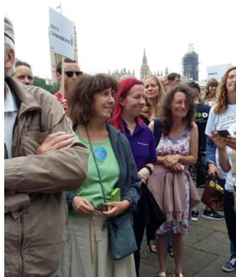
Part of the S Cambs contingent