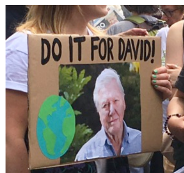
A placard that caught my fancy!

We – or should I say Heidi Allen, our MP - have a request to make. Along with thousands of others I attended 'The Time is Now': the mass lobby of Parliament about climate change held on 26 June . Several people from South Cambridgeshire spoke to Heidi, who is working with a cross-party group of MPs in an organisation called 'More United' ( https://moreunited.org.uk ). This group is currently focusing on the climate crisis and hoping to influence the contents of the upcoming Queen's Speech.